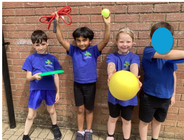
14 - Equipment provided due to taking part in National Sports Week