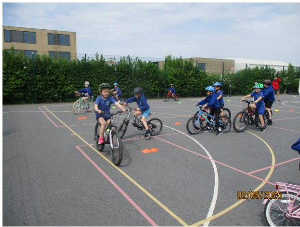
12 - Bikeability