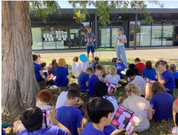
4 - CROPS change support