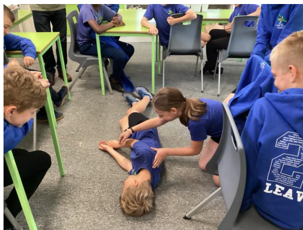
3 - First Aid training