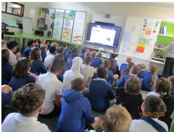
5 - Kooth webinar