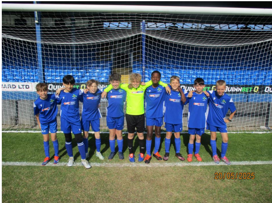
10 - Football Team