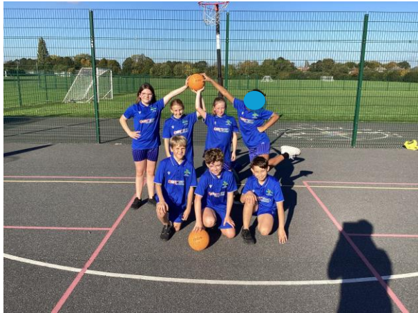
8 - Netball