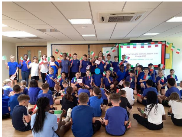
2 - Italian Graduation