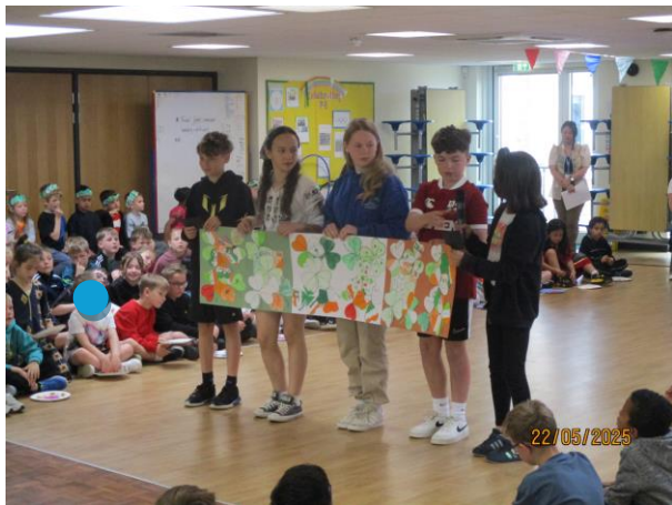
9 - Culture Week