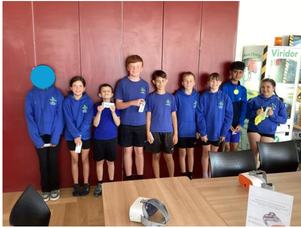
11 - Eco Council