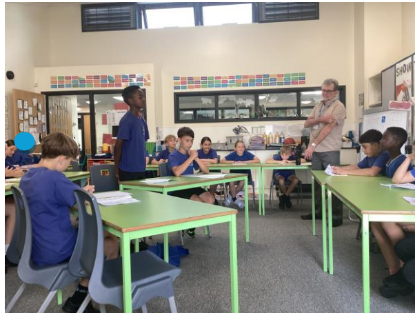
1 - Magistrates visit