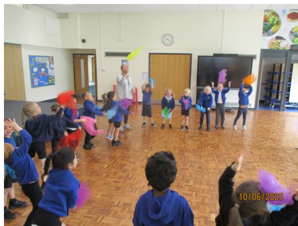
16 - Circus skills day