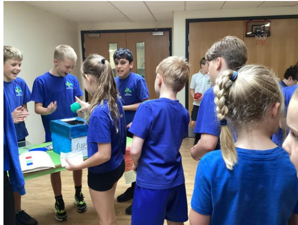
15 - Year 6 Enterprise