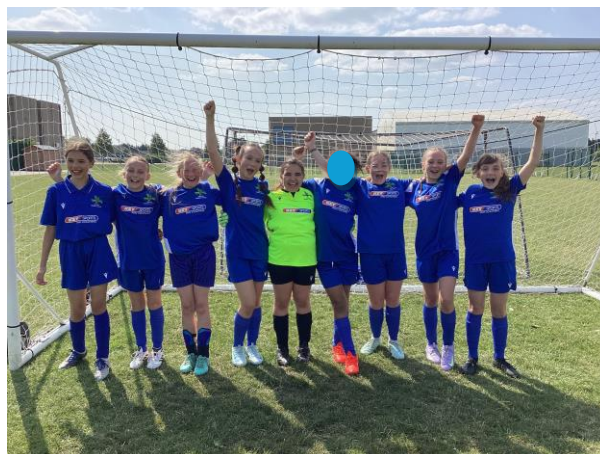
7 - Girls' football team

The NSPCC delivered an online safety workshop for parents with lots of top tips and information. We have added this to our website if you were unable to attend.