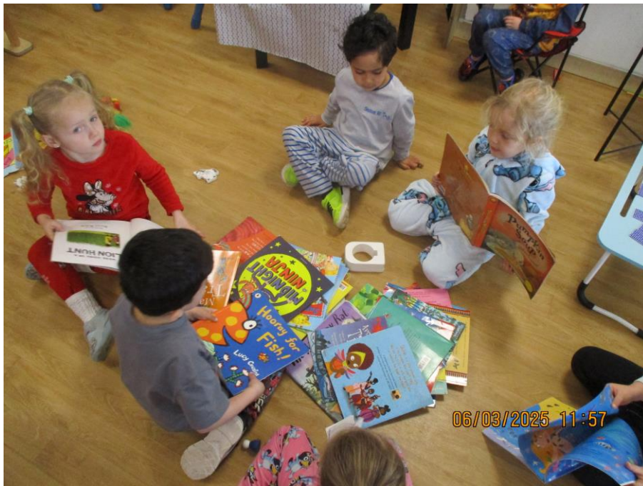
3 - World Book Day in Reception