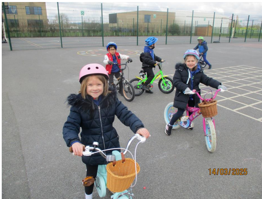
10 - Year 1 Learn to Ride