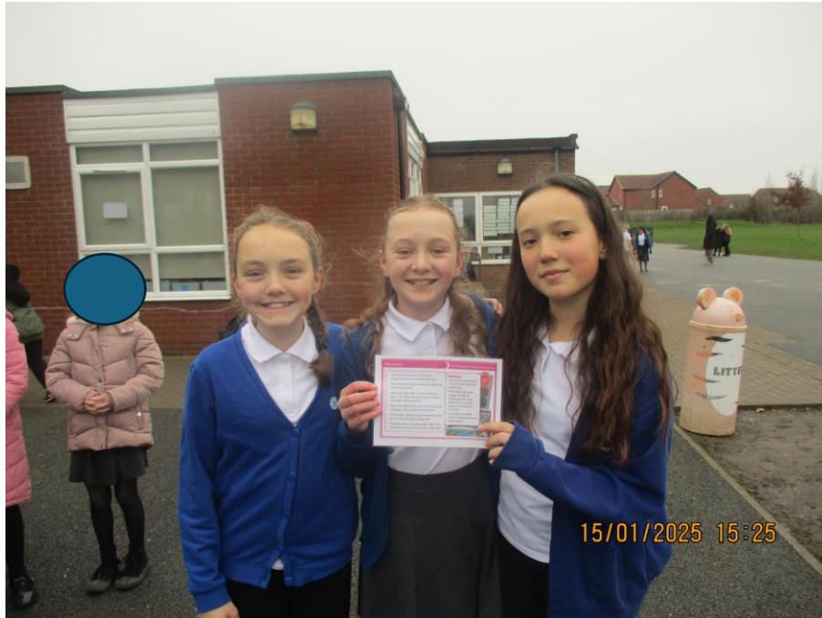
7 - Play Leaders training