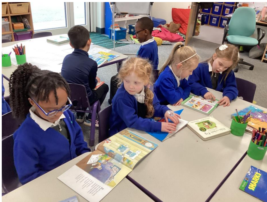
8 - Year 1 and 3 celebrate their win