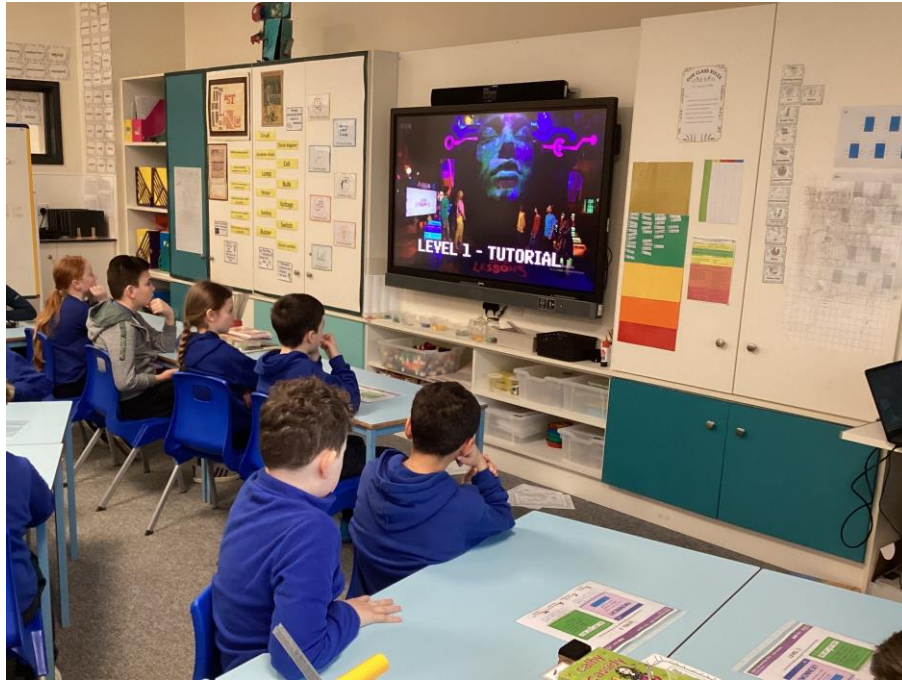
5 - Internet Safety Day- Year 5 joining a live event