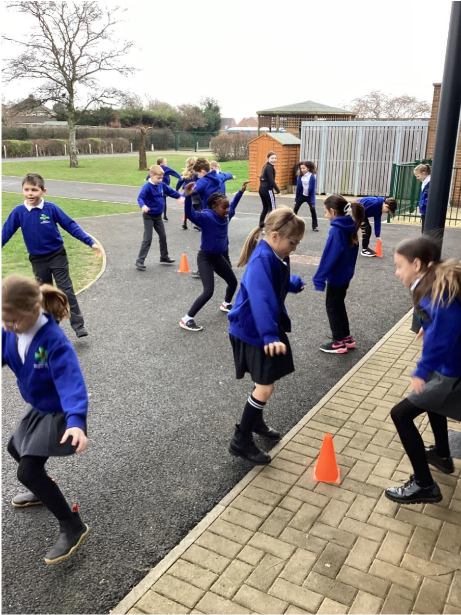
6 - Get Set for January