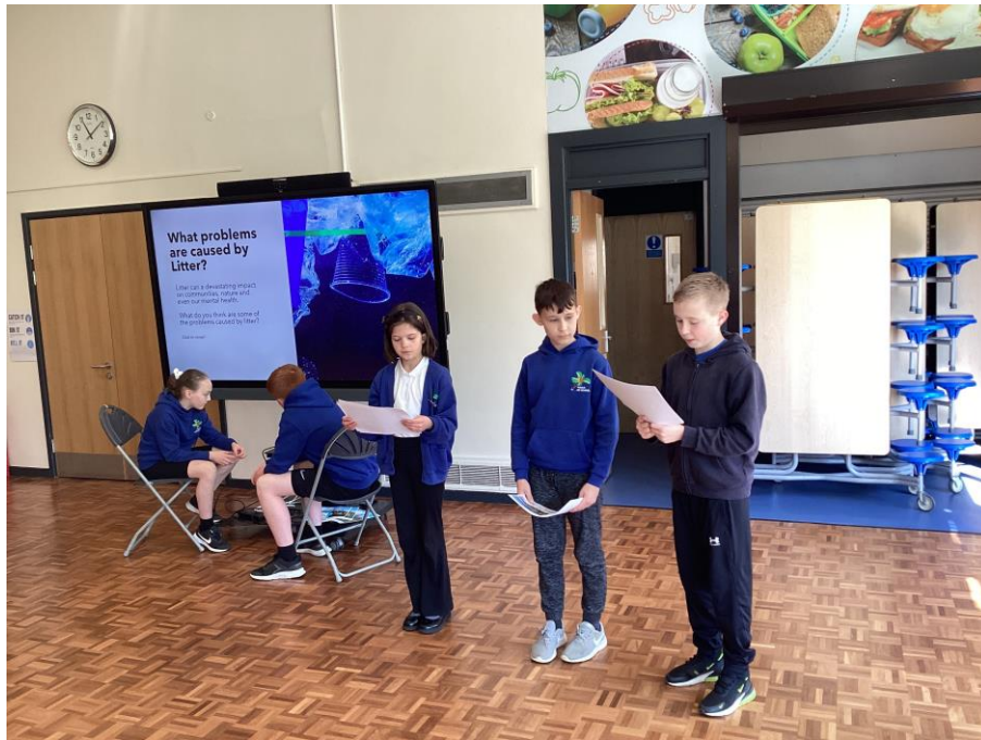
11 - Year 6 School and Eco Council leading assembly