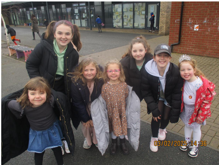
1 - Break the Rules Day