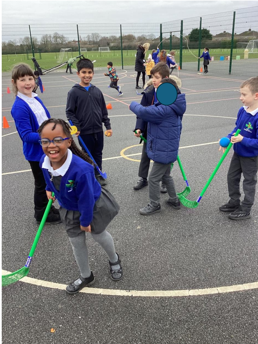
4 - Winner extra playtime