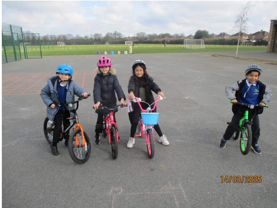
9 - Year 2 Learn to Ride