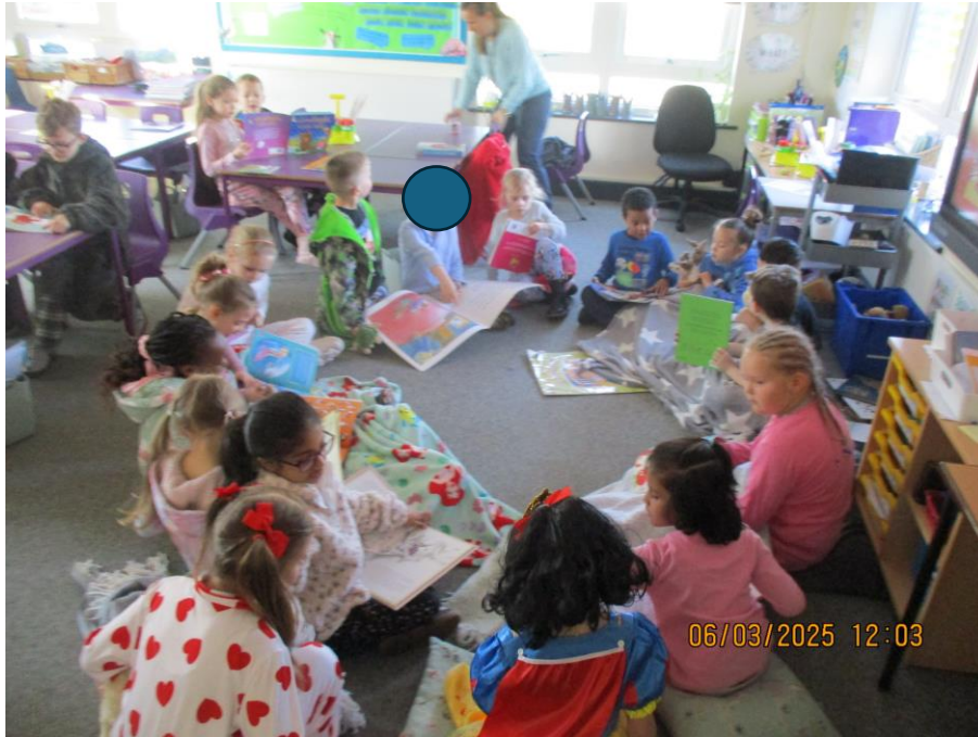
2 - Year 2 World Book Day