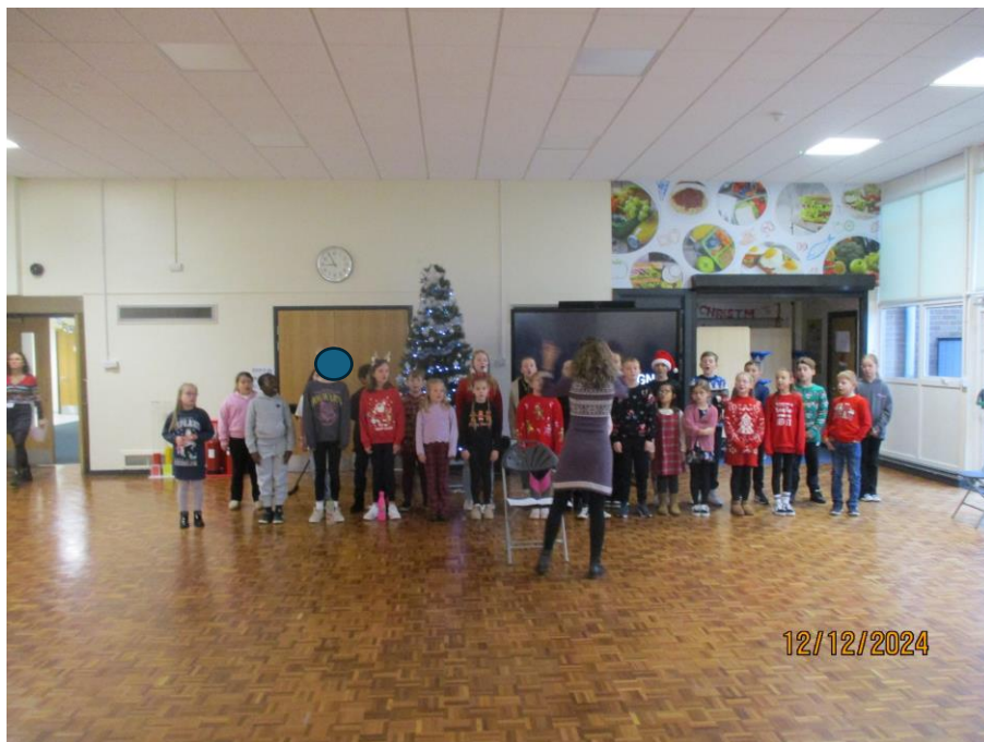
8 - Our school choir