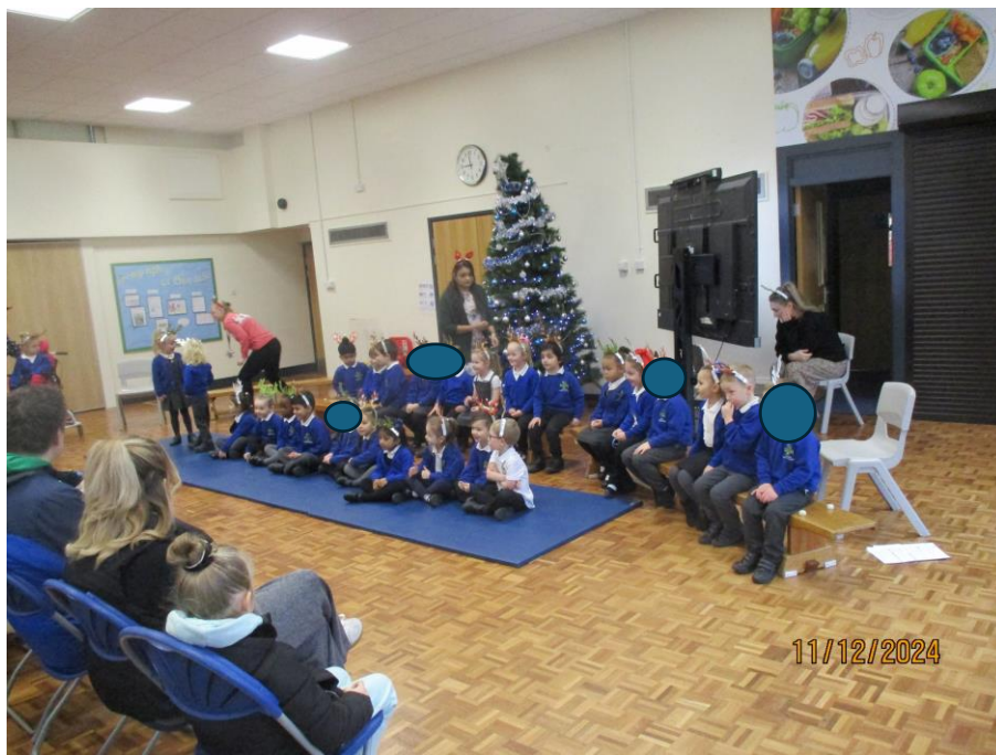
6 - A2 Reception singing