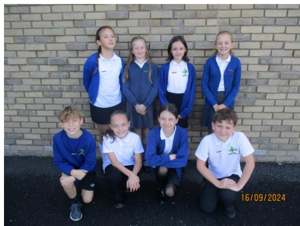
1 - House Captains