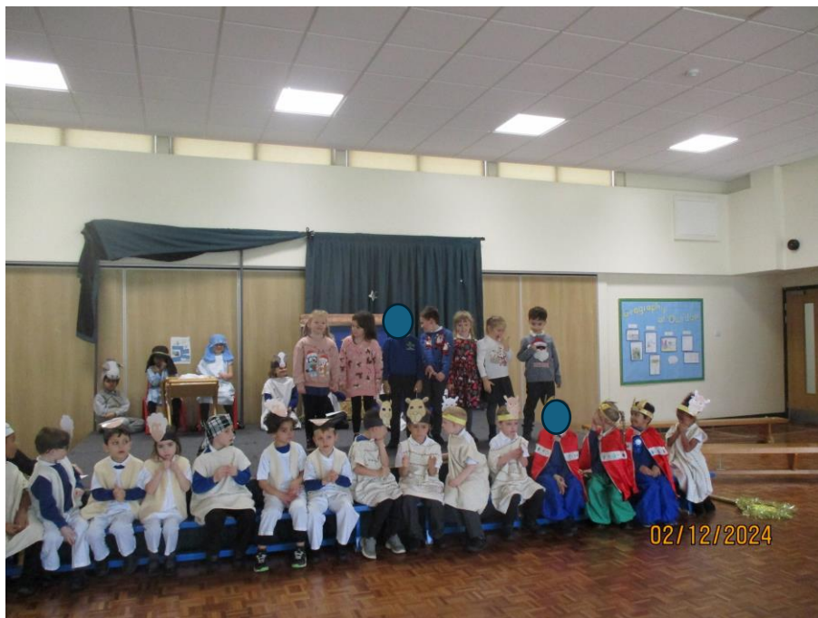
4 - Year 1 Nativity