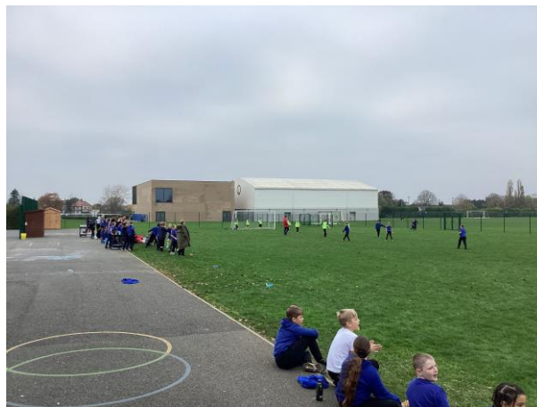
2 - Year 5/6 football tournament

'We used our experience in the trenches and our knowledge of the topic, including reading Private Peaceful , to write letters home from the trenches. We were writing as if we were soldiers. We used language from the time and described the experience of living in the trenches as they had lice and rats to deal with as well as the mud. It was horrible. Most attacks were at night so they slept in the day.' Kudzwai