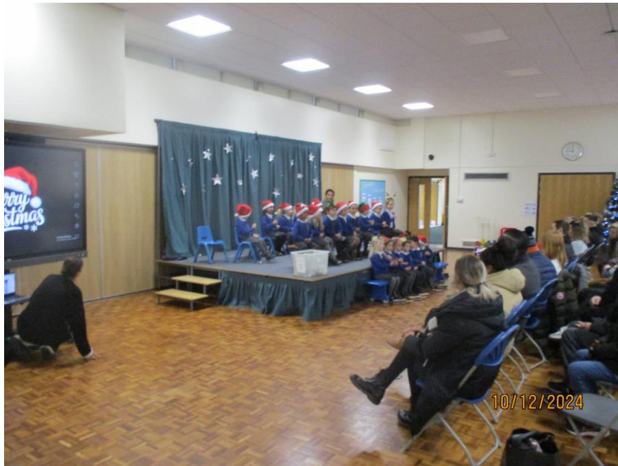
5 - A1 Reception singing