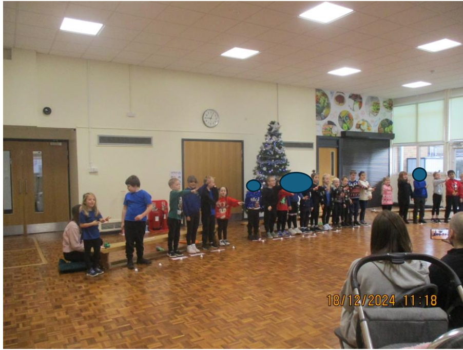
9 - Year 2 Christingle