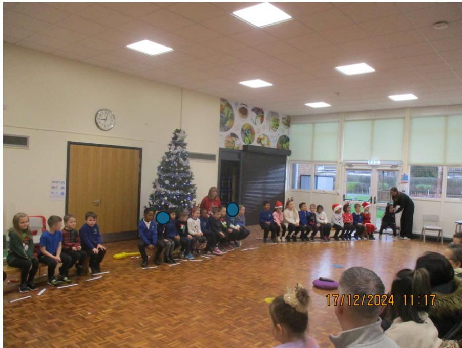
7 - Year 2 Christingle