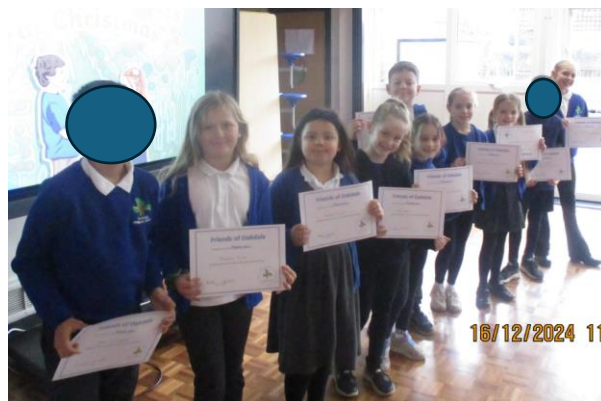
10 - Helper certificates